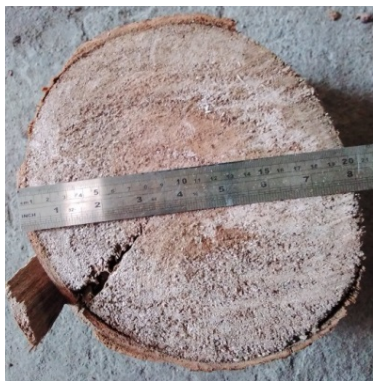
Figure1. Cross section of the red meranti stem