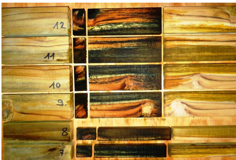
Figure 2. CCA treated test specimen from Australia. (Source: Norton 2012).

The same phenomenon was also observed in another hardwood genus, poplar. In the course of study on the CCA treatment and durability of poplar timber, a zone of refractory wood at the sapwood/heartwood boundary was observed. The most striking feature of CCA in Poplar tacamahaca x trichocarpa 32 was the observation of an impermeable zone, generally consisting of two growth rings, at the boundary of the sapwood and heartwood (Murphy et al. 1991). Furthermore, in 2012, Norton conducted a vacuum pressure impregnation using copper-based preservative system (CCA and Copper Naphthenate ) on six and a half year old of teak containing sapwood and heartwood obtained from tropical north Queensland Australia. The result showed that from the six specimens, the outer zones of the sapwood were fully penetrated and the heartwood remained un-penetrated. The transition zone is apparent in samples 9, 10 and 12 and is not penetrated (Figure 2).